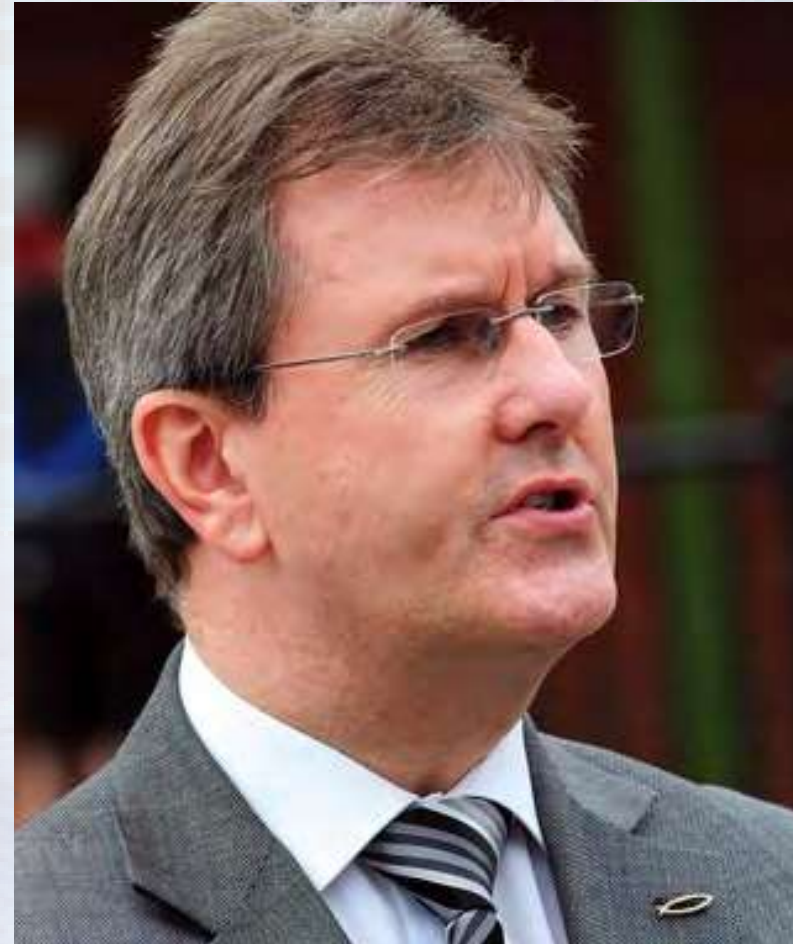
Sir Jeffrey Donaldson, M.P. 2017

“As a Member of Parliament, I travel all over the world and wherever I go I find evidence of the enormous influence the Ulster-Scots people have had. Our people have had a big impact on the world stage and I am so proud of my Ulster-Scots heritage and the music, poetry, dance, language and traditions that are associated with it. Ours is a rich inheritance and we do well to preserve it for future generations.”