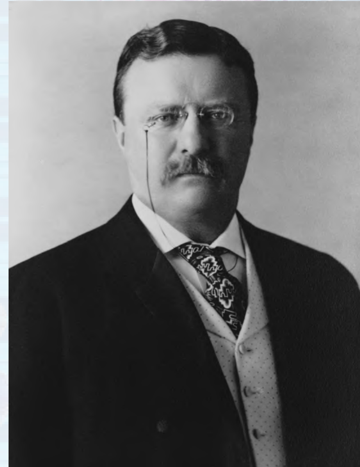
President Theodore Roosevelt, 1901-1909

“In the Revolutionary war...the fiercest and most ardent Americans of all were the Presbyterian Scots-Irish settlers and their descendents...the love of freedom rooted in their very hearts’ core.”