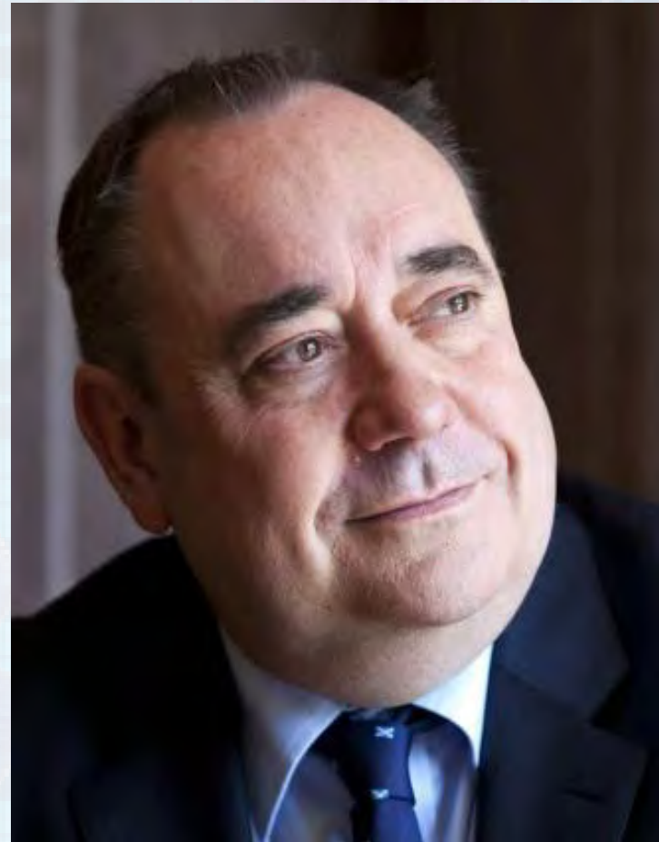
First Minister Alex Salmond during his visit to Stormont, 2007

“Northern Ireland and Scotland are the closest of neighbours, economically and culturally. You are the blood of our blood and the bone of our bone.”