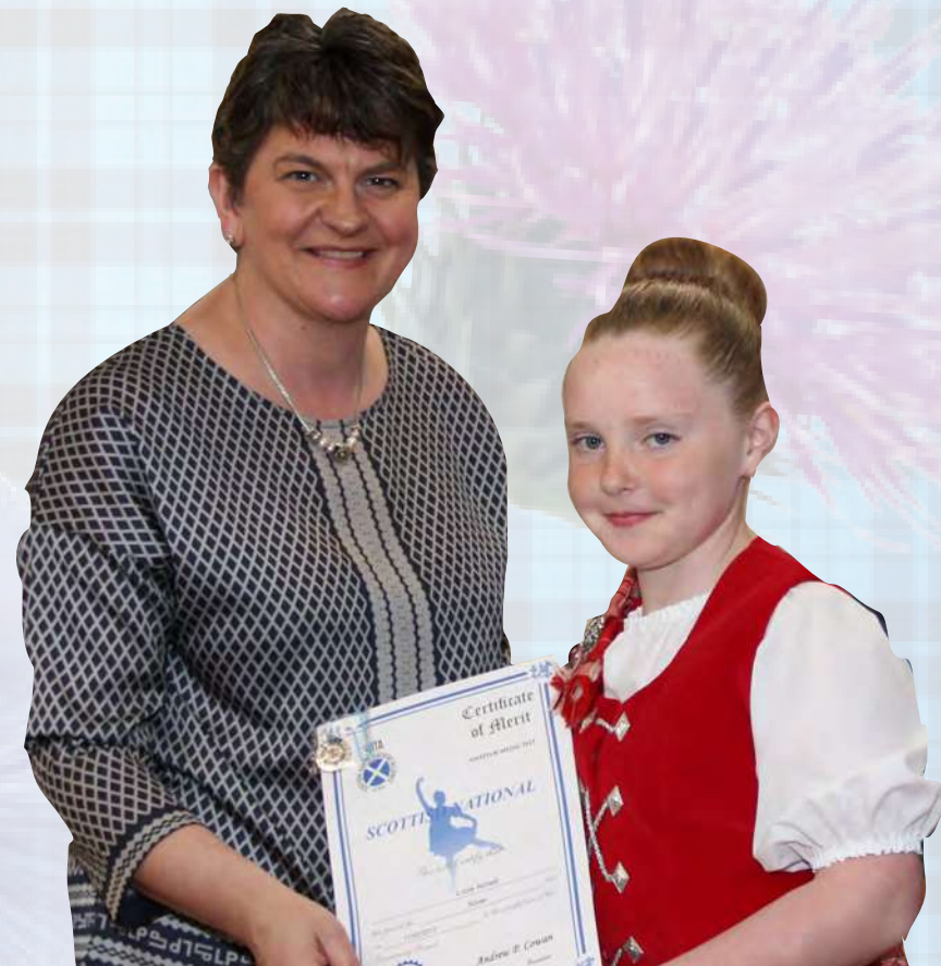
Right Honourable Arlene Foster MLA, Former First Minister, Northern Ireland, 2017

“Ulster-Scots culture is widely recognised right across the world. Many people do not have to look too far into their family tree to see an Ulster-Scots link. This culture aided the development of the United States and the role which many Ulster-Scots played in World Wars was significant to the peace and freedom we enjoy today. Anybody who studies or enjoys the Ulster-Scots tradition will see a rich culture which has added so much to the fabric of our lives today.”