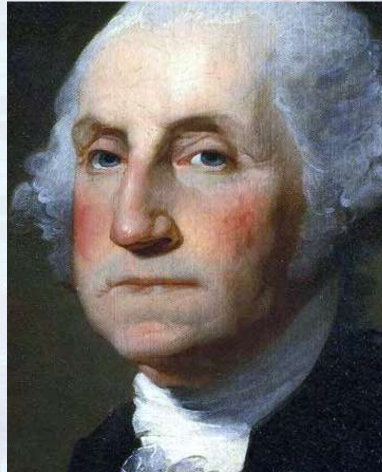
President George Washington, 1789-1797

“If all else fails, I will retreat up the valley of Virginia, plant my flag on the Blue Ridge, rally around the Scotch-Irish of that region and make my last stand for liberty amongst a people who will never submit to tyranny whilst there is a man left to draw a trigger.”