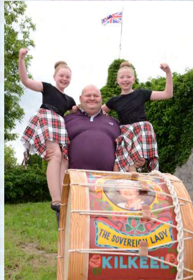
The Schomberg Society, 2017

“Our Ulster-Scots identity, its culture, traditions and heritage are the common threads that bind and tie our community together. Its preservation, promotion and protection for future generations are something we in the Schomberg Society are particularly proud to maintain.”