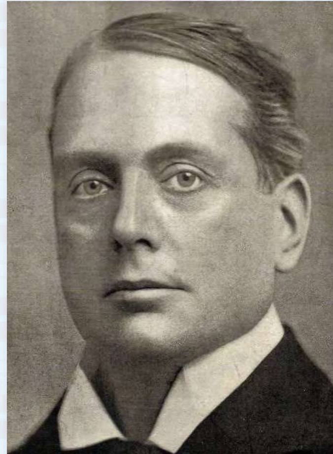
Lord Rosebery, Prime Minister of the United Kingdom, 1894/95

“I love Highlanders, and I love Lowlanders, but when I come to the branch of our race which has been grafted on to the Ulster stem I take off my hat with veneration and with awe. They are, I believe, without exception the toughest, the most dominant, the most irresistible race that exists in the universe at this moment.”