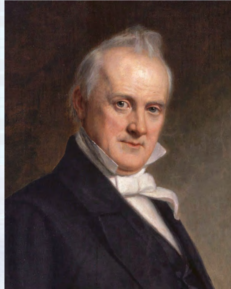
President James Buchanan, 1857-1861

“My Ulster blood is my most priceless heritage.”